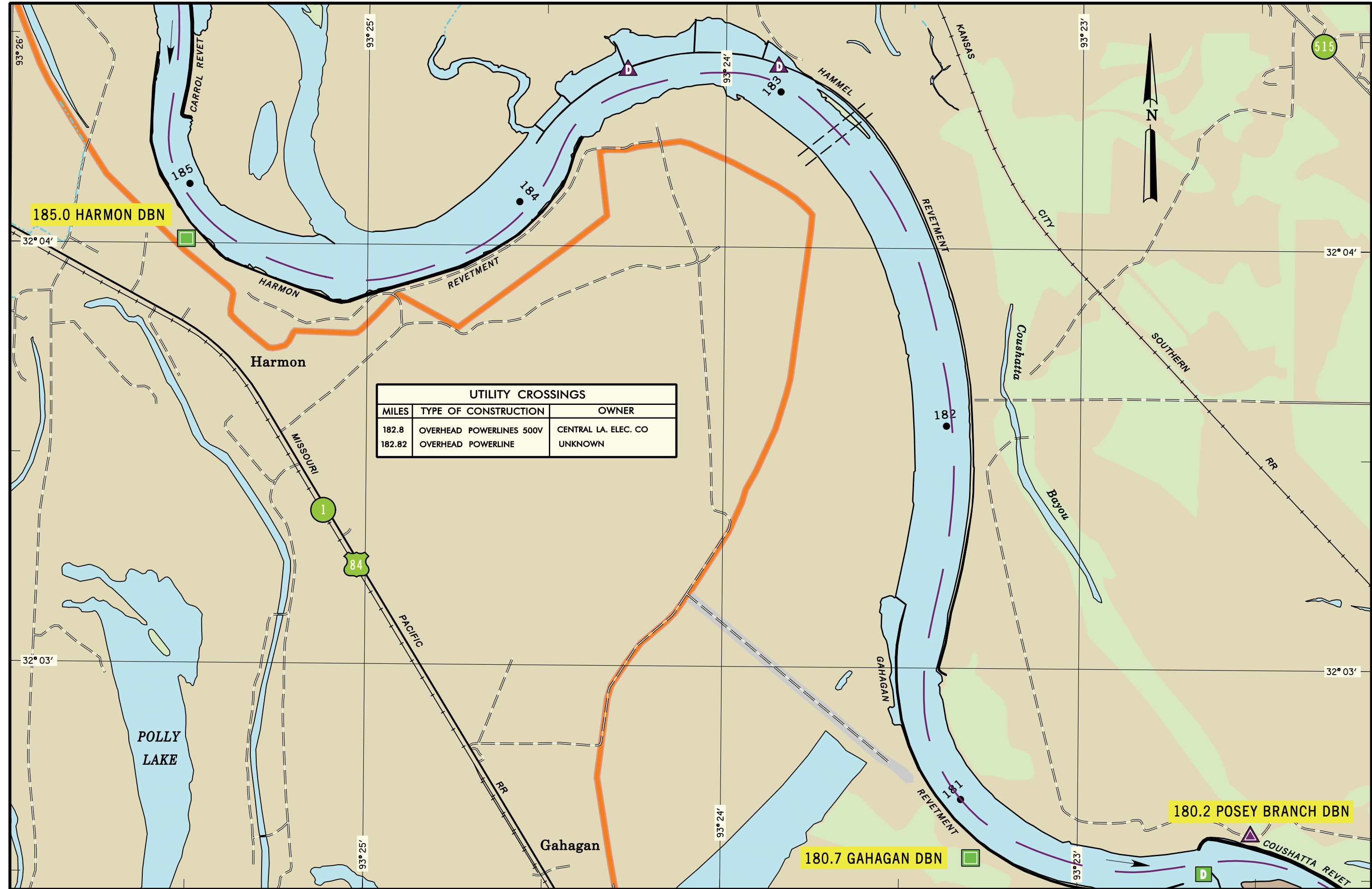
CHART NO. 16